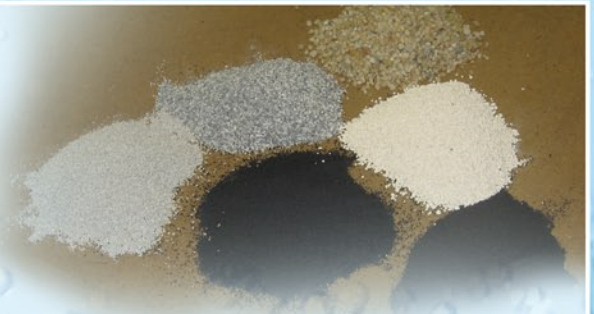
Well water flows through media that traps heavy sediment before it reaches the faucet.

A tall tank of granular media is set next to the pressure tank in the basement. As water from the well flows through the media, heavy sediment is trapped. The system is set to automatically backwash the sediment from the tank – it's that simple.