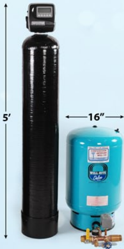
Slim, tall tanks are tucked neatly next to the water tank in the basement.

If heavy sediment is a problem in your home, the solution is a backwashing sediment filter from Contoocook Artesian Well. Our system is maintenance free. There are no filters to change or chemicals to add. Simply set it and forget it.