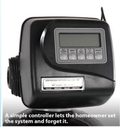
A simple controller lets the homeowner set the system and forget it.

Troublesome bits of grit plugging the screens in the faucet. Settling in the tub. Accumulating in the toilet tank. Blocking the hoses to the washing machine and dishwasher.