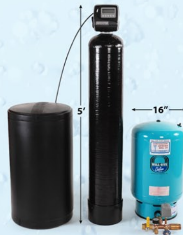
The salt tank, left, is refilled every three to four months. Tiny beads in the tall tank remove excess minerals.

The second tank contains salt, which is refilled by the homeowner every three to four months. The salt is readily available at home improvement stores and costs around $6 to $7 per bag. An average of five bags of salt are required, depending on the amount of water used during the timeframe.