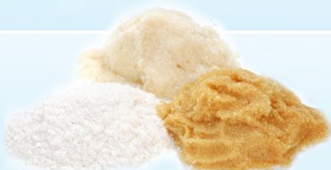
Polystyrene beads attract undesirable minerals and remove them from your water.